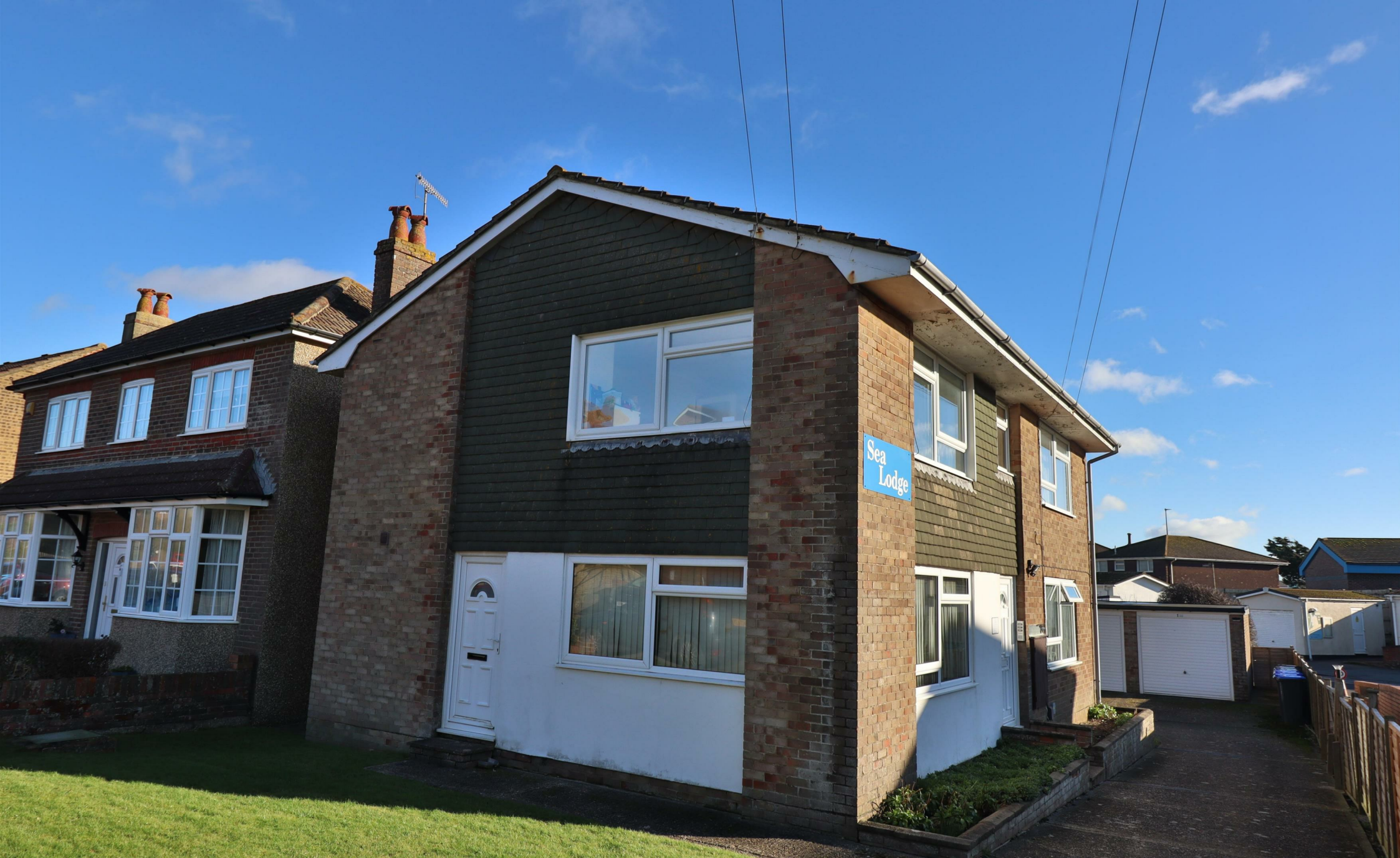
3 Sea Lodge Old Salts Farm Road, Lancing, BN15 8JD £850 Per Calendar Month